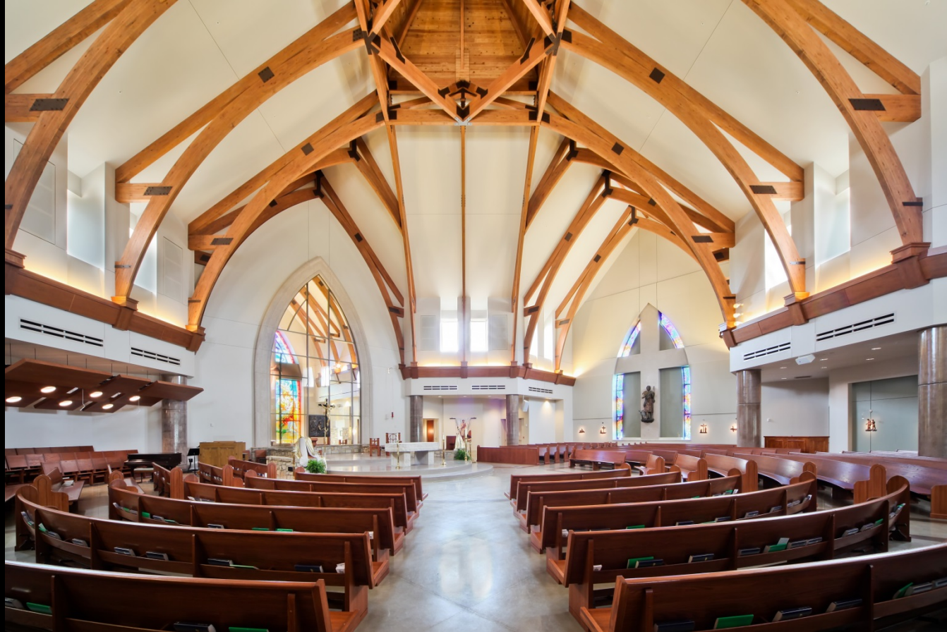
View looking Southeast with the “Jesus the Good Shepherd” statue and stained glass window in view on the right and the Altar and Daily Chapel on the left. The Choir area can be seen on the far left. The radial pew configuration can be seen along with the diagonal aisles that orient back to the center of the Rotunda space and the Altar.