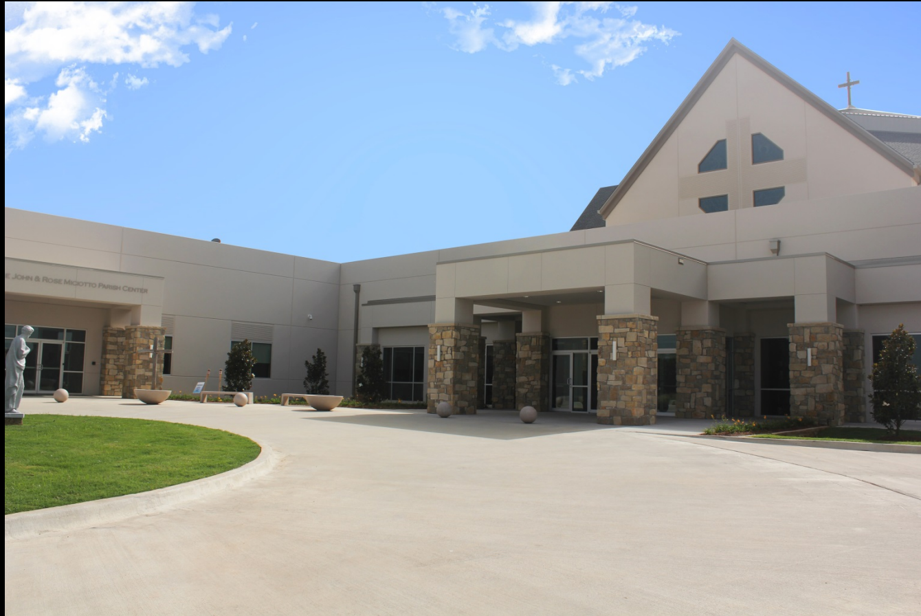
View of the Arrival Court and entry to the Narthex from the West side of the building. The "Rose" window is visible at the West wall above. Concrete tilt-wall panels were used for the exterior wall construction with limestone veneer base and column cladding.