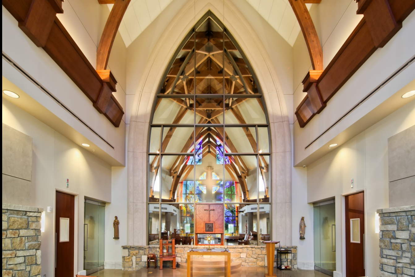
View looking West from Daily Chapel through glass that separates the Daily Chapel and the main Sanctuary with the Tabernacle in view. The reflections in the glass are of the "Resurrection" stained glass window and the risen cross with the "Rose" stained glass window also in view in the background.