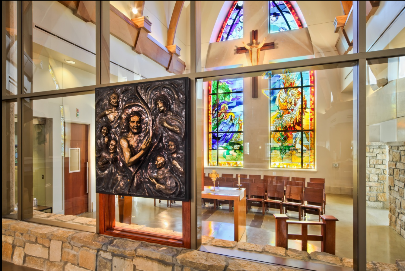
View looking East through the glass wall separating the Altar and Daily Chapel with the Tabernacle in the foreground. The "Resurrection" stained glass window and Risen Cross are in the background at the East end of the Church.